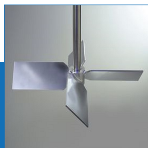
PBT - 4