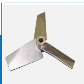
NH - 3